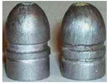
Left- Unfired bullet Right - Fired bullet

The bases expand evenly on all loads. 24 gr. is as much black powder as it will hold. That is level full with the case mouth. When you seat the bullet the powder goes up into the hollow base. More to be done of course.