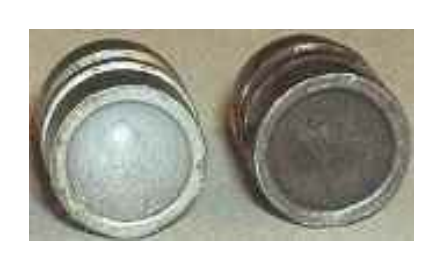
Left- Unfired bullet Right - Fired bullet