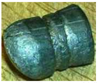
Note the rifling engraved full length of the bullet

<u>Jim Taylor Article Index</u> <u>Complete LASC Article Index</u>